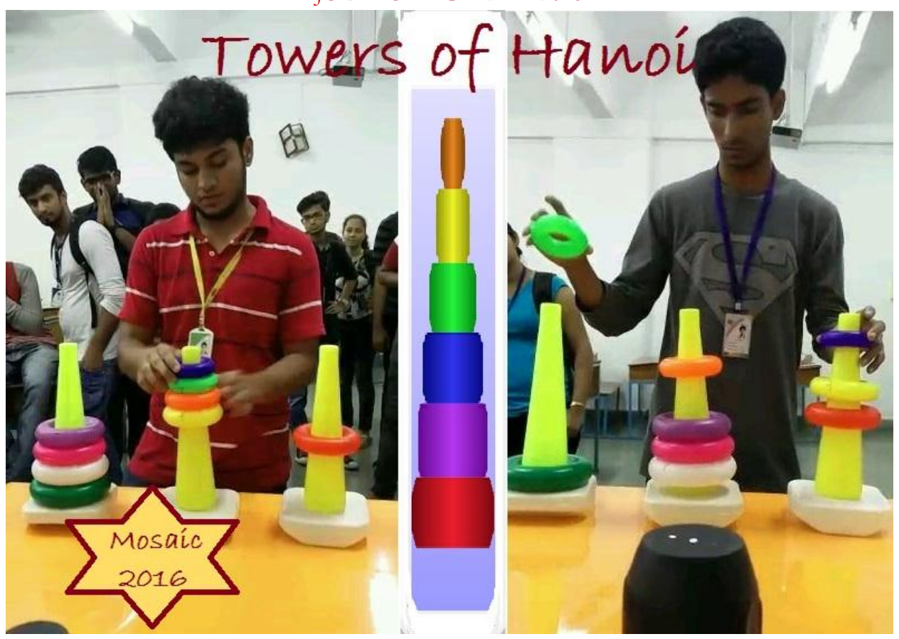
MOSAIC 2016 Events and Winners